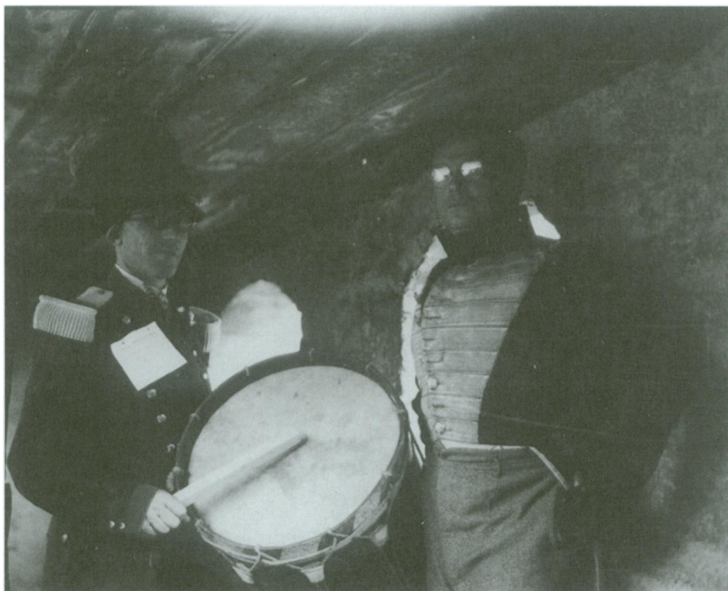
1. Le Corbusier and Giedion at the fancy-dress ball that followed the signing of the Declaration at the First International Congress of Modern Architecture (CIAM), on June 28, 1928 (FLC L4-14-60).